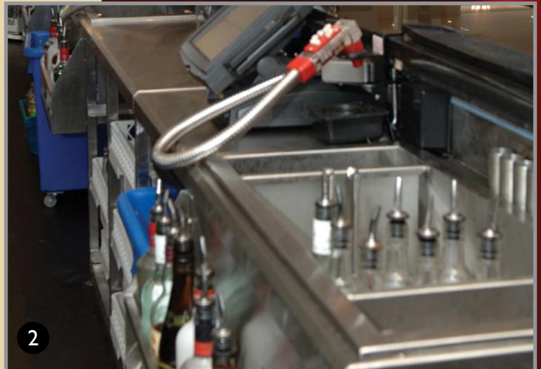
1 1/2 BAR FRAME SUPPORT

Designed for simple installation of all bar equipment. Fixing holes to top and bottom